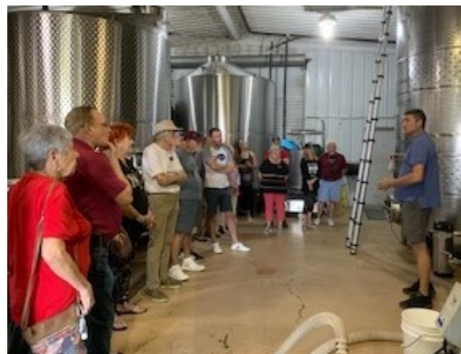
Winery Tour by the Owner