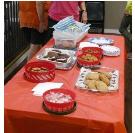
Cookie Fest—We all had our fill!